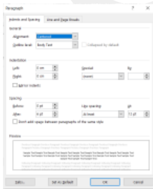
Figure 1: A sample of how to write single line figure caption in research paper

Captions of a single line (e.g. Figure 1) must be centered whereas multi-line captions must be justified (Figure 2), same is applicable to table as well.